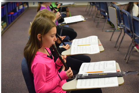
Fourth grade students play their recorders