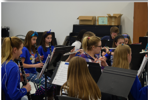
7th Grade Band