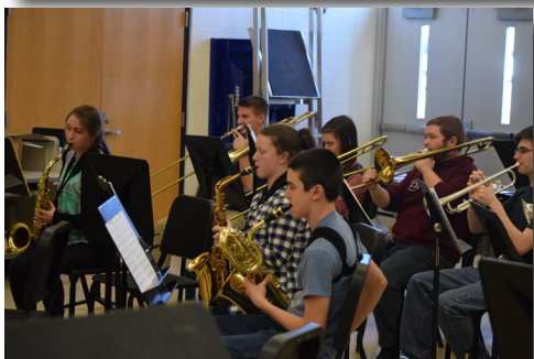
High School Jazz Band & Pit Orchestra