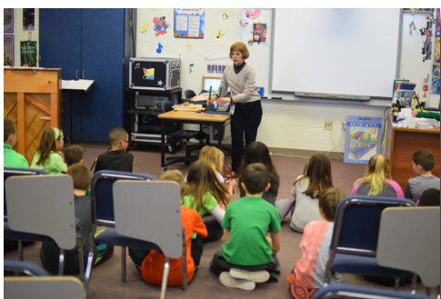
Third grade students play rhythm sticks