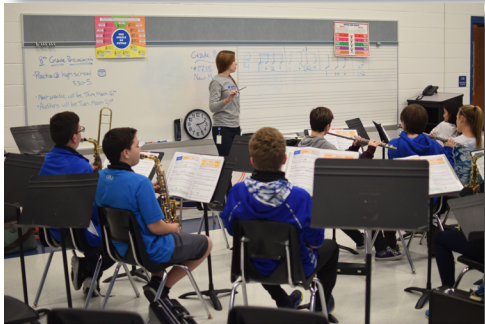
8th Grade Band